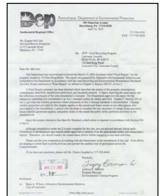
PADEP Act 2 Release of Liability